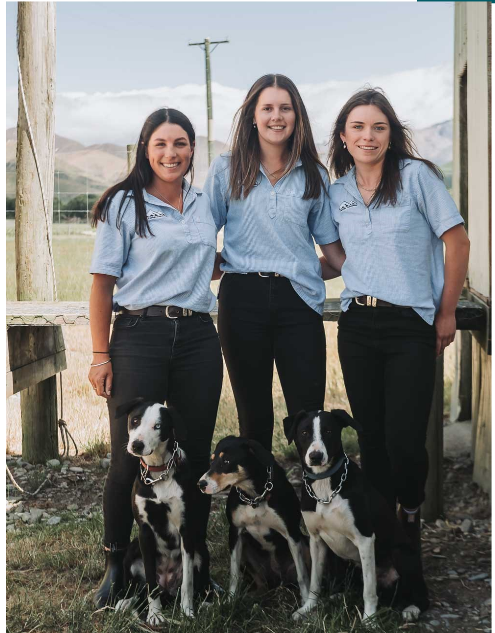
2023 Interns from Left to Right