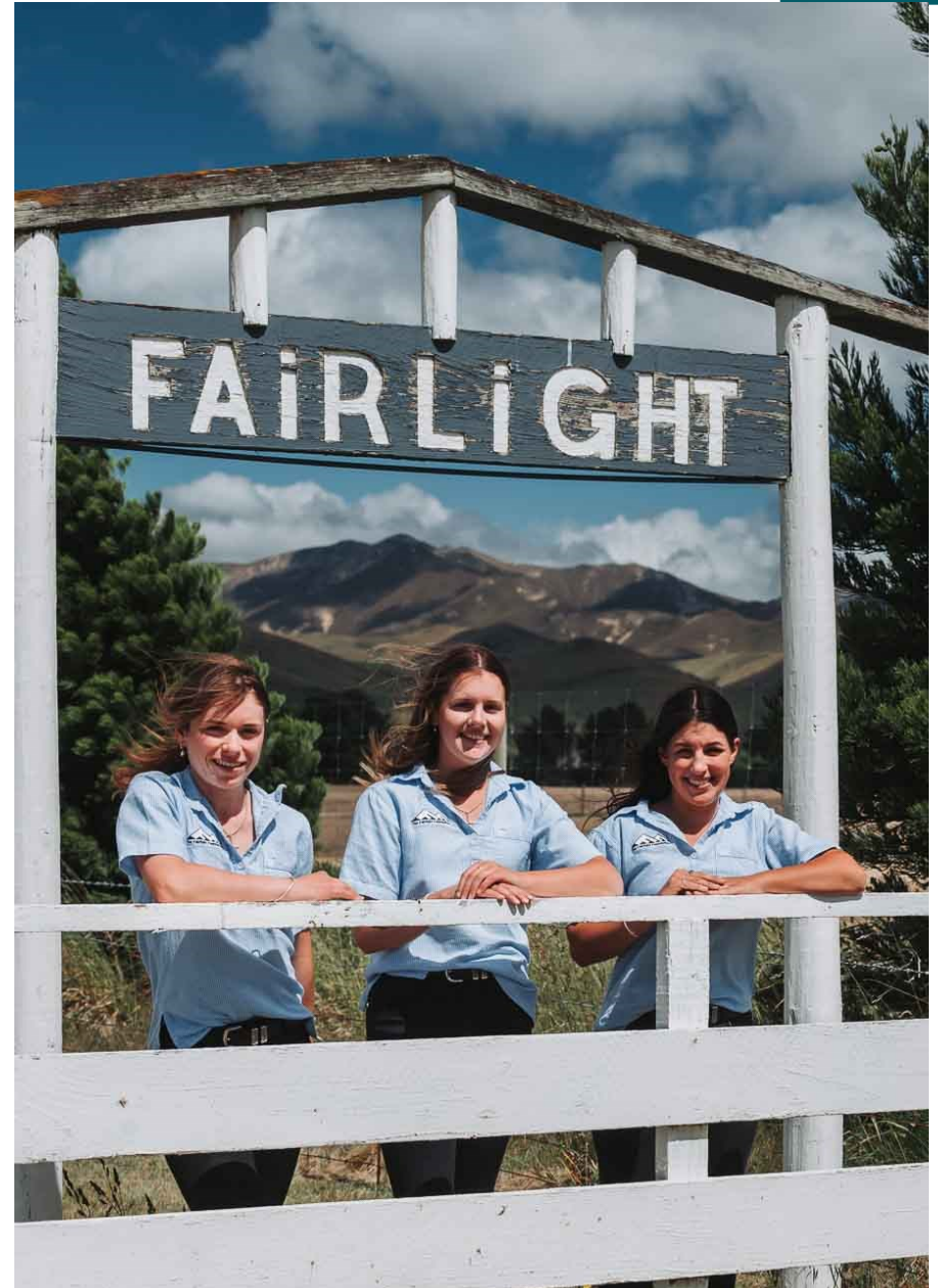
2023 Interns from Left to Right

The interns travelled with the Fairlight farming team to Fairlight's partner station at Forest Creek to attend a Headwaters Field Day. The Field Day was attended by other Headwaters suppliers and specialist agronomy team Presentations and workshops covered included updates on supply contracts for Lumina Lamb and chicory management at Forest Creek with Agricom.